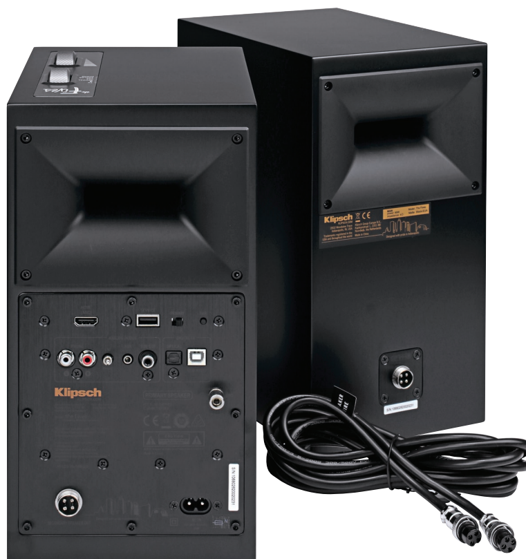
The right loudspeaker (at left in this picture) carries a small 110V-240V mains input, a four pin connector for the right passive speaker, plus an array of digital and analogue inputs. The RCA phono sockets are switched between Line and Phono for a turntable. There is a subwoofer output too.

The Fives have vivid dynamics making them sound lively and bold – meant in the best sense. There was no shortage of bass even with Bass EQ switched out. In fact, I checked a few times just to make sure because bass was on the heavy side for my taste, even in our large (6550 cu ft) listening room where small loudspeakers can sound lost. The trombone behind Hans