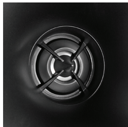
A 1 inch (25mm) titanium dome tweeter with phase cap and Tractrix horn loading that gives it wide dispersion and optimal acoustic coupling.

Yet at the same time there was none of the obvious tonal imbalance – especially from raised treble – that pollutes so many UK loudspeakers nowadays. Klipsch don't do that. They keep it clean and accurate,